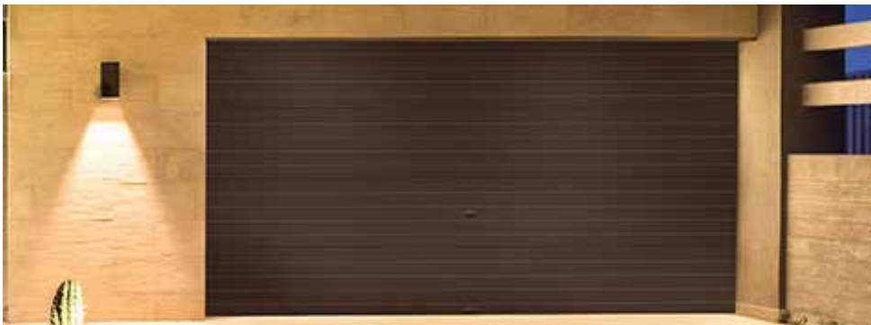
Clopay Modern Steel for illustration only. Glazing will be required.