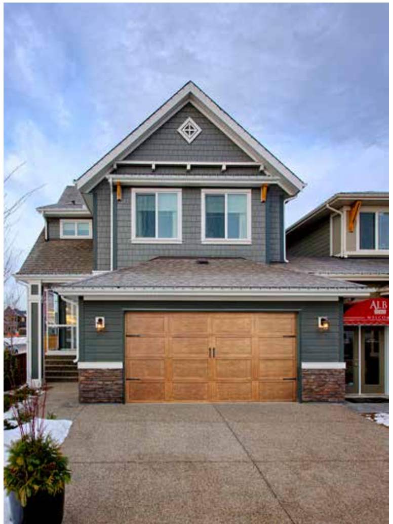
Theme illustration only.