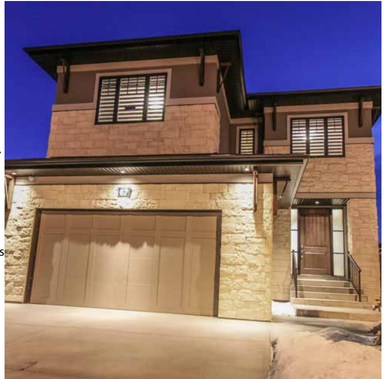
Theme illustration only.