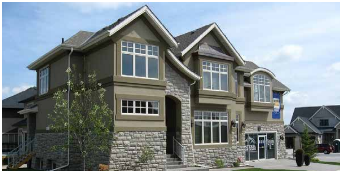
Theme illustration only.