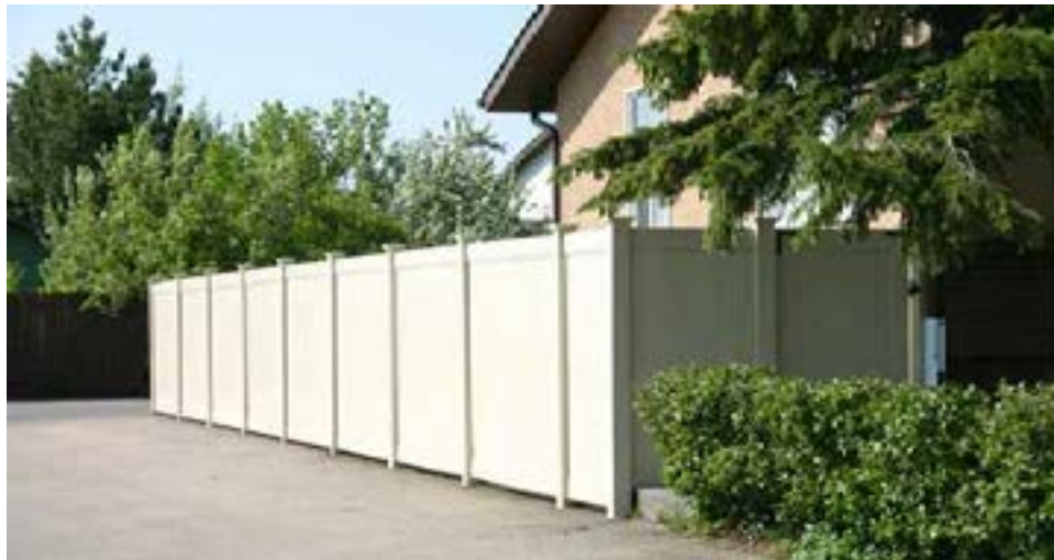
1.8m (6.0ft) Beige Vinyl Fence

Rite-Way Fencing Inc. Brent Keller 403-243-8733 7710 - 40 Street SE Calgary, AB T2C 3S4