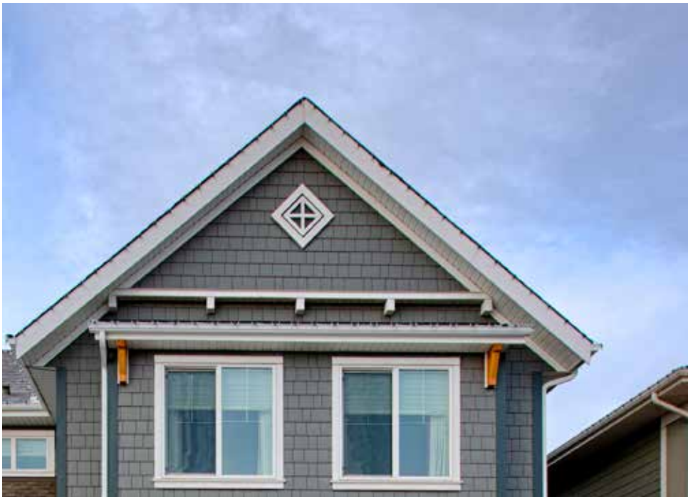
Theme illustration only.