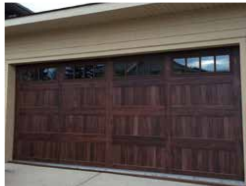
C.H.I. Accents Series