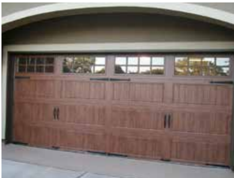
Clopay Gallery Collection

Garage doors are not to exceed 8 feet in height and 20 feet in width unless approved by the Architectural Coordinator. The distance from the top of the garage door and the eave is not to exceed 2'-0". Homes that exceed this distance will require architectural detailing to reduce the amount of siding above the garage door.