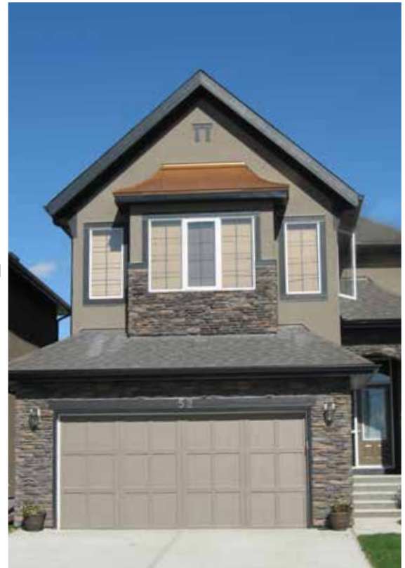
Theme illustration only.