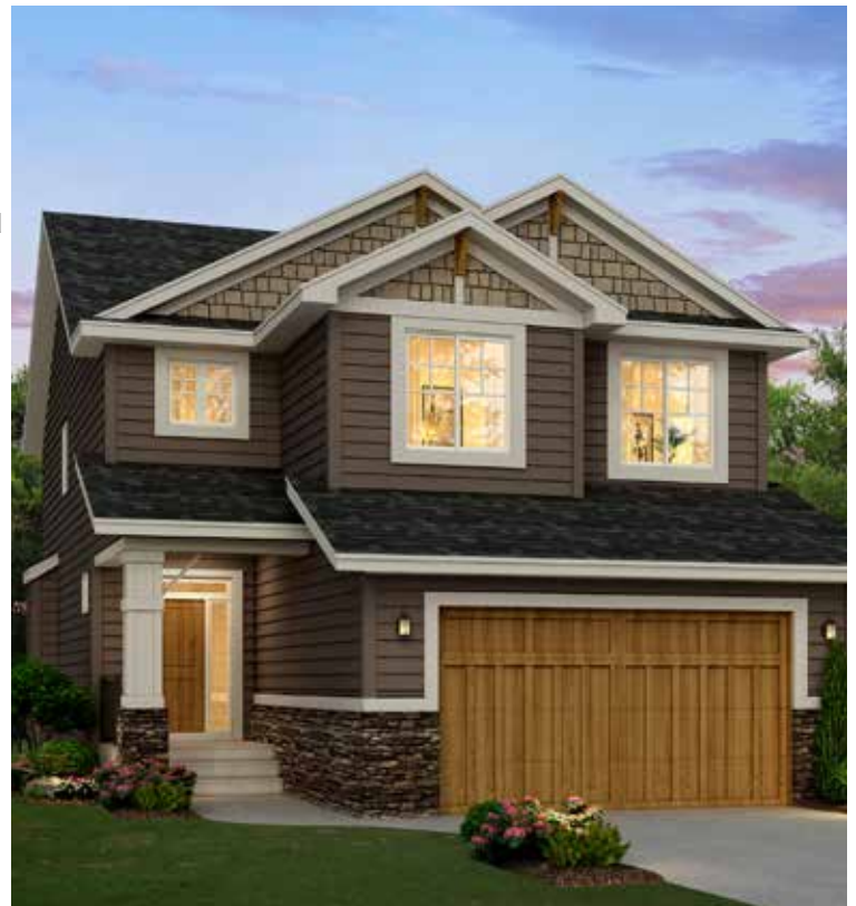
Theme illustration only.